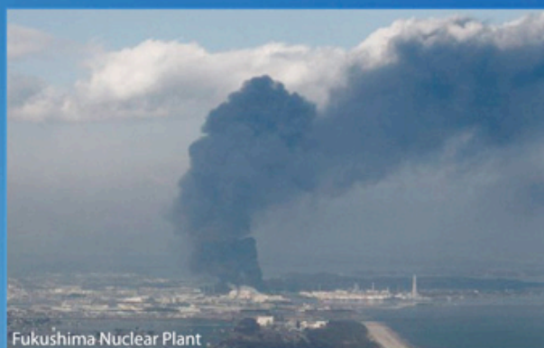
Fukushima Nuclear Plant

REGULATORY LOOPHOLES AT U.S. NUCLEAR PLANTS